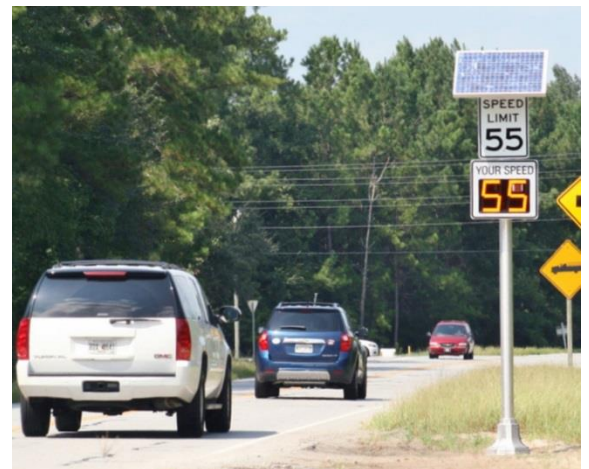
Figure 18. Example Speed Feedback Sign

A speed feedback sign should be installed just north of the community entry chicane for northbound traffic and the existing southbound speed feedback sign should be placed just north of the bridge structure at Lower Bridge Way.