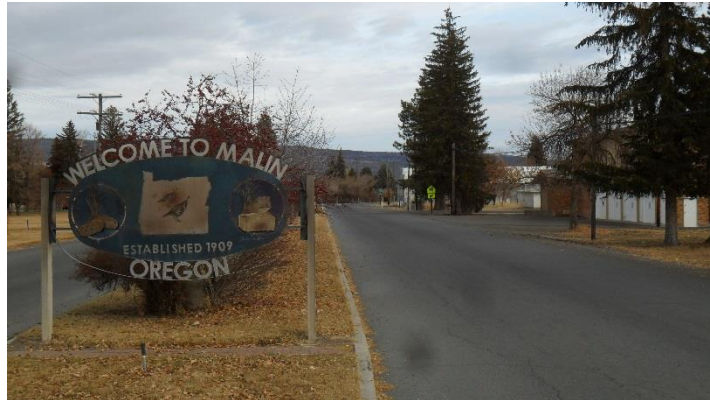
Figure 17. Example Gateway Sign

Gateway welcome signs should ultimately be placed at the extremities of the community – just north of Lower Bridge Way and just south of 11 th Street at both the entrances and exits.