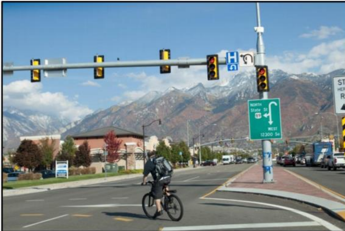
Figure 20. Example Wayfinding Sign

U-turn based wayfinding signs and other guide signs should be considered during the final design project. U-turn signs would be useful for drivers at the southbound U-turn at US 97/11 th Street, the southbound U-turn at US 97/Central Avenue, and northbound at the junction of 11 th Street/US 97/Lower Bridge Way.